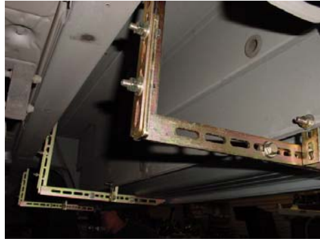
Passenger side above w/ bracket#1,2,4,5.