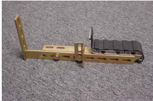
Configuration to mount on outside pinch weld.