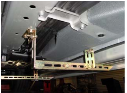
Passenger side shown above & next 4 photos.