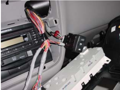
Wire location is behind radio bezel

98-09 Odyssey (low clearance) *Use bracket#4 for extension, may require trimming brackets.