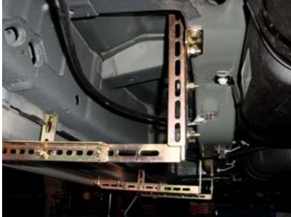
Driver side shown above & next 2 photos.