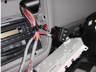
Wire location is behind radio bezel

98-09 Odyssey (low clearance) *Use bracket#4 for extension, may require trimming brackets.