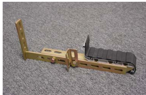
Configuration to mount on outside pinch weld.