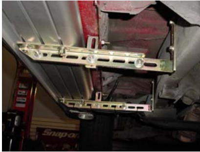
Picture shown above is the underside of a 1999 Passport driver side.

94-04 Passport/Rodeo/SLS *Requires trimming bracket#2 to length. Mount bracket#5 on outside pinch weld.