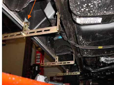
Driver side brackets config shown for 2001 ML320.