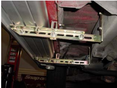
Picture shown above is the underside of a 1999 Passport driver side.

94-04 Passport/Rodeo/SLS *Requires trimming bracket#2 to length. Mount bracket#5 on outside pinch weld.