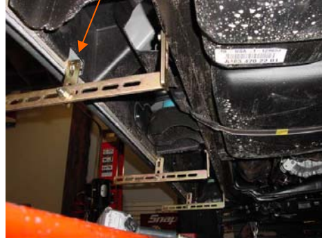
Driver side brackets config shown for 2001 ML320.