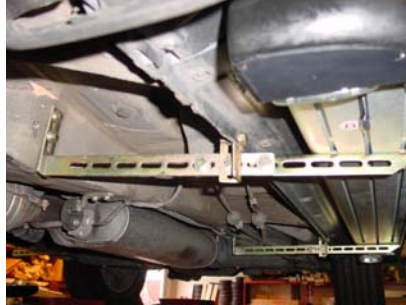
Driver side shown above.